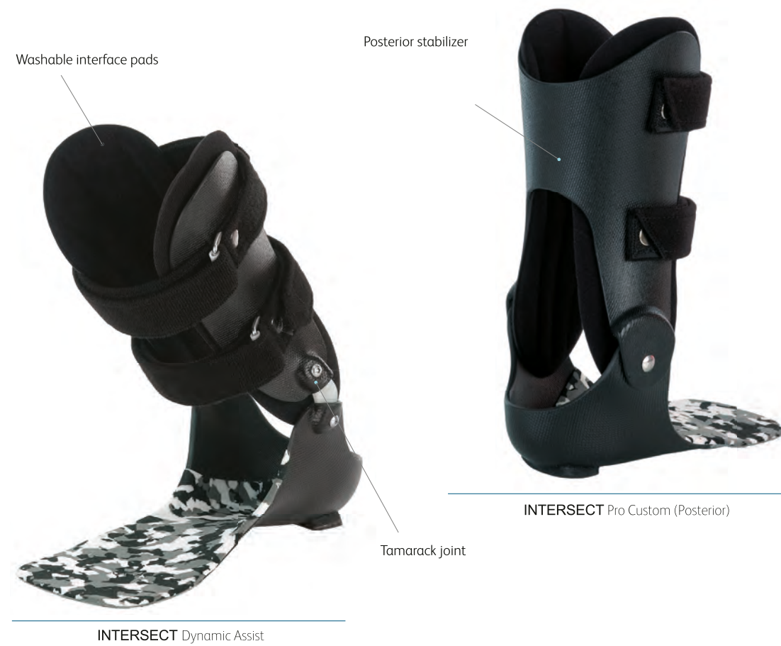
INTERSECT Dynamic Assist